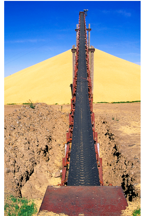
Figure 2. Grain Conveyor

Engineers should also look for switches that offer greater installation flexibility to fit the needs of their applications. Switches such as those offered by Honeywell including hazardous location limit switches, BX, CX, EX, GSX, and LSX Series, or the V15W2 Series basic switch, offer a variety of options for levers, actuators, circuitry designs, operating temperature range, contacts, and housing materials to meet a variety of harsh industrial applications. They also are available in a variety of sizes to meet application needs.